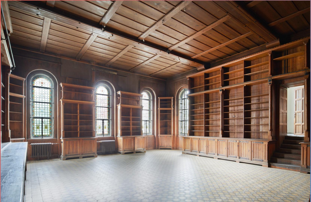
(First workshop hall)