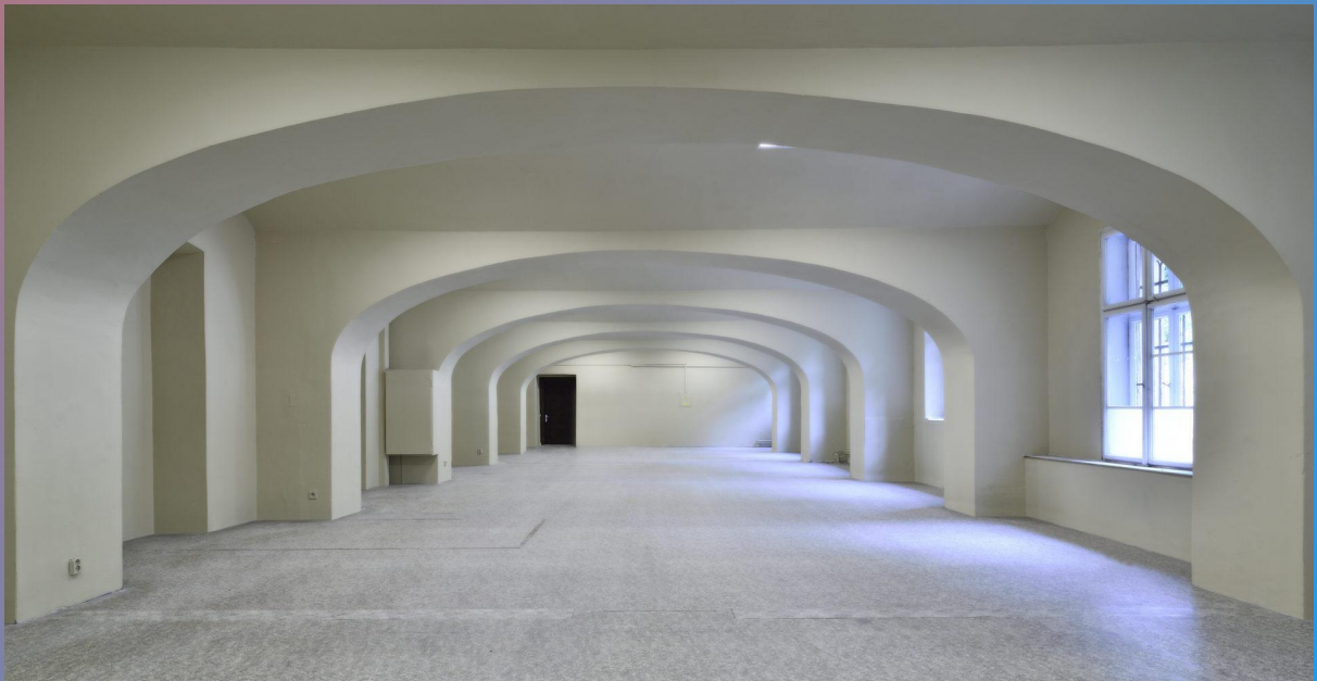
(Third lecture hall)