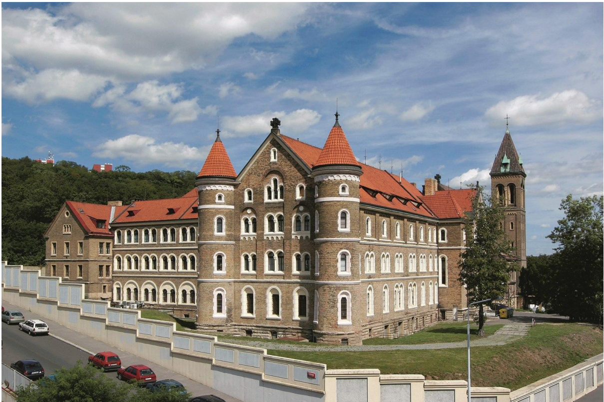
(The main event venue - Gabriel Loci monastery in Prague)

The other smaller events will take place on several different locations in Prague a few days before and after the conference, connecting the program with another major crypto event, ETHPrague, beginning on June 10.